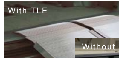
With the use of a TLE, the rear bumper is easily cleared

The TLE will increase the reach of the SUITCASE® Signature Series™ ramp by extending the lip from the standard 3" length to 9". The EZ-ACCESS TLE is unique because it can be added or removed as needed, eliminating the need for a large ramp inventory. Shipped as a pair.