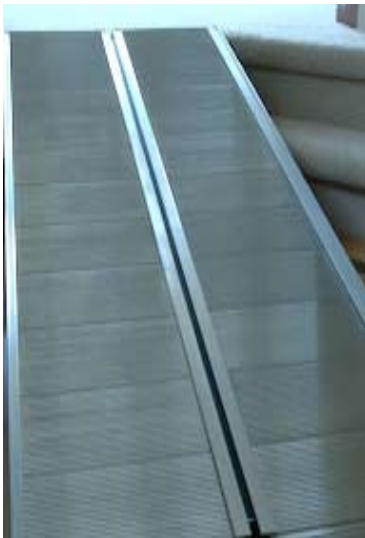
Features a no-pinch, non-protruding live hinge for safe, silent, and maintenance free operation

Introducing the new SUITCASE® Signature Series™ ramp. While similar in appearance and function to the faithful SUITCASE Classic Series ramp, the Signature Series version features several innovative design enhancements. From the no pinch, non-protruding full-length live hinge and durable, ergonomically designed handles to the enhanced extruded tread for superior traction, this ramp was redesigned from the ground up to be simply the best in the industry. Top Lip Extension (TLE) compatible. Available in 2' – 8' lengths with an 800-pound weight capacity.