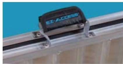
Ergonomically designed flexible, non-breakable handles offer convenient carrying and a comfortable grip