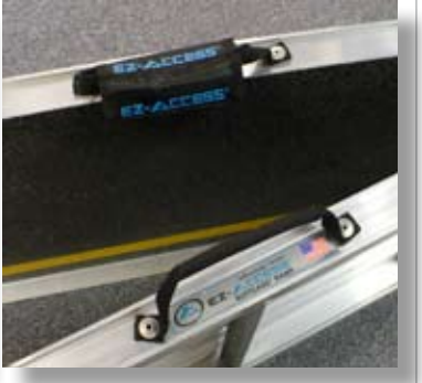
Ergonomically designed flexible, nonbreakable handles offer convenient carrying and a comfortable grip