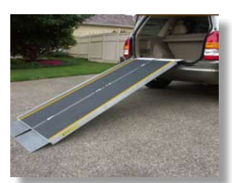
Bottom transition plates adjust to uneven terrain